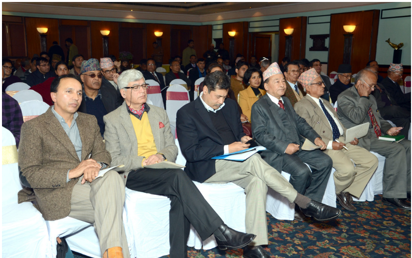
Former Diplomat Participants at the Talk Programme.