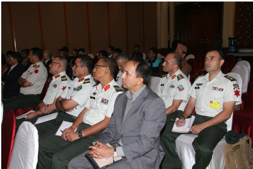
Nepalese Army Participants at the Seminar