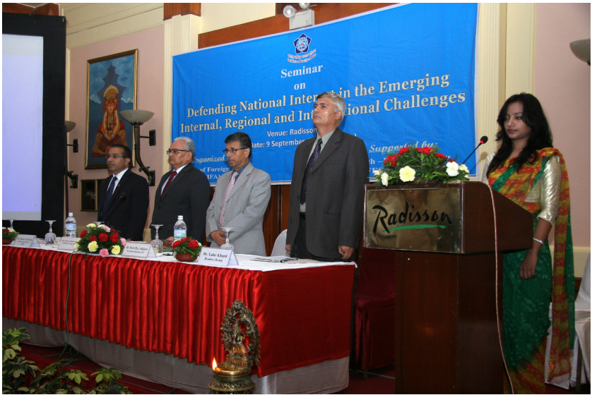
National Anthem during Inauguration of Seminar