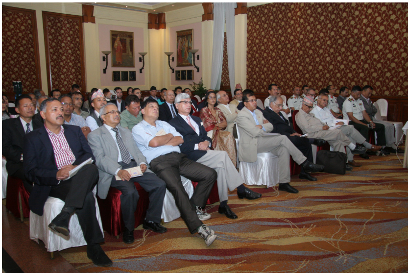
General participants at the Seminar