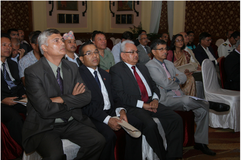
Before the start of seminar